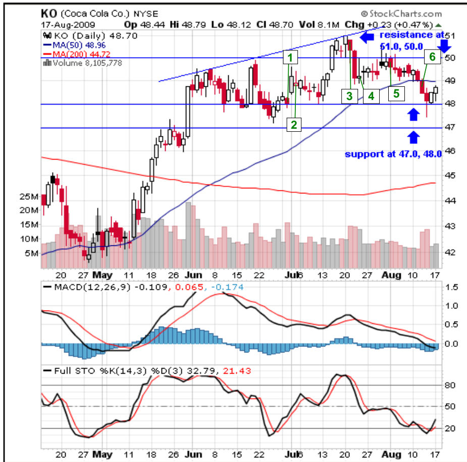
Chart courtesy of StockCharts.com